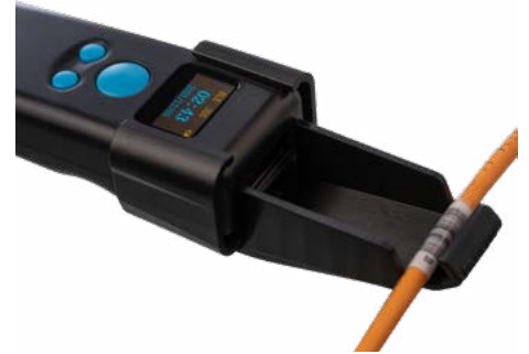
Bluetooth®-enabled handheld barcode scanner and pre-labeled cable