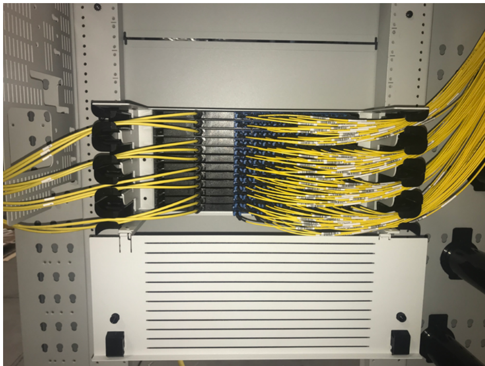
Patch Panel with 12 fixed trays

Panduit Patent US 1072528: Modular Fiber Tray